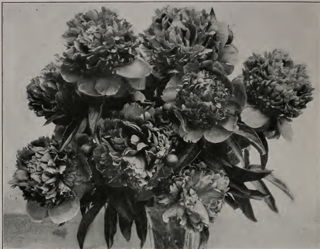
Augustin d-Hour—One of the Best Reds